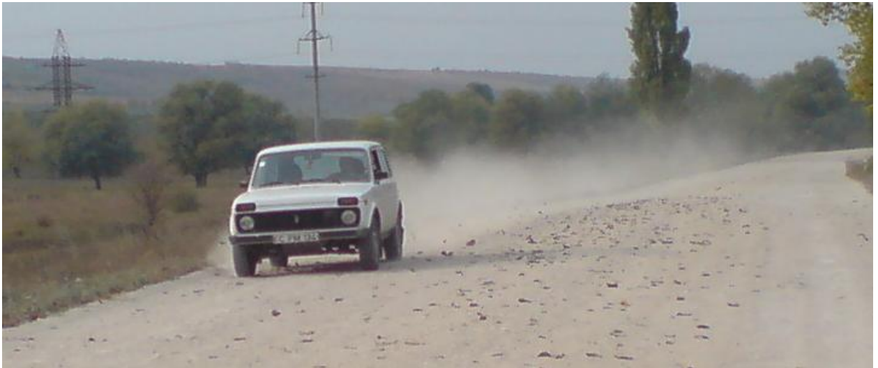
Figure 5.1.1.1 Dust clouds formation on the gravel roads.

Changing gravel coverage into cement concrete coverage will significantly reduce dust concentration in the 50-100m area of the road. In particular, this will be emphasized in localities, where dust clouds were sitting in the households of the inhabitants.