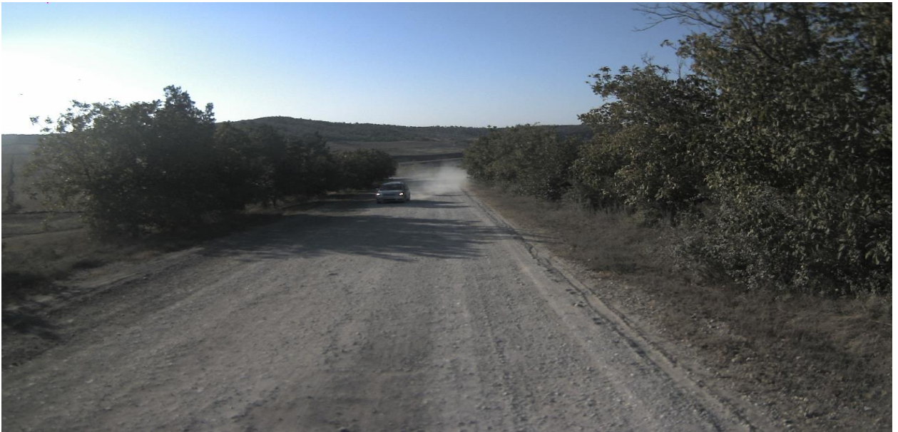
Figure 3.9.1. Dust clouds formation on the gravel roads, km 5+060.

The technical condition of the road essentially influences the environment. Road unevenness (pits, subsidence, etc.) stimulate noise and vibration increase as well as fuel consumption (up to 20%), which increases the amount of harmful emissions in the atmosphere. Roads with gravel coverage are sources of dust, which negatively affect the area around the road (50-100 m). In particular, this is evidenced during the summer, when the plantations are covered with dust, which essentially diminishes the photosynthesis process, thus reducing the harvest of the agricultural crops. It also negatively affects the localities, where dust clouds settle in the households of the inhabitants.