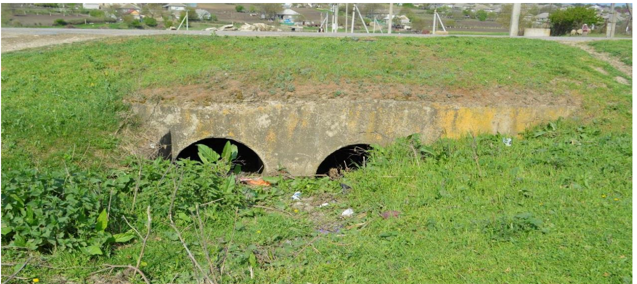
Figure 3.9.2. Silting an essential part of the culvert, km 7,400

The unsatisfactory level of maintenance of art works has contributed to the erosion of downstream alluviums to some culverts, as well as the mudslide of an essential part of the culverts. This has contributed to the acceleration of the erosion process and the flooding of the neighboring territory.