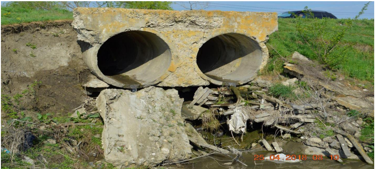
Figure 5.1.2.1. Downstream erosion of the culvert with partial degradation of the culvert, km 1,80 Corridor I.